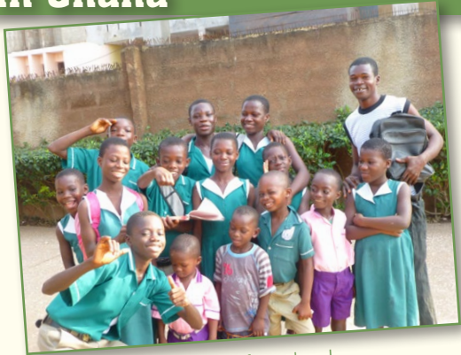
Ready for school