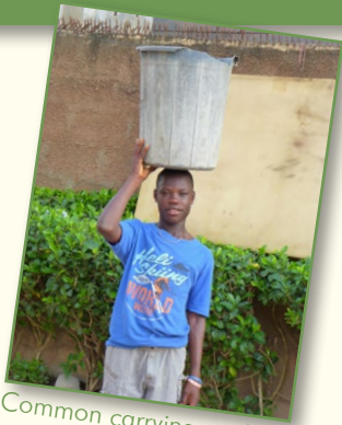
Common carrying method