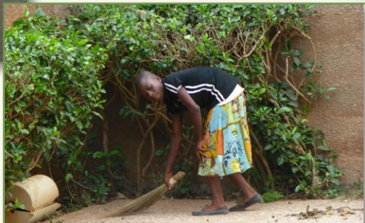
Sweeping the walk